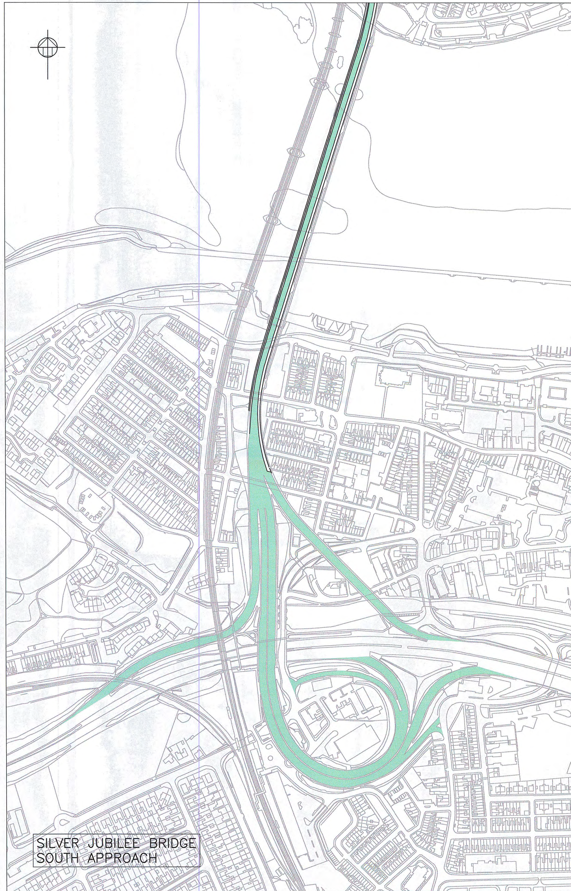
SILVER JUBILEE BRIDGE SOUTH APPROACH