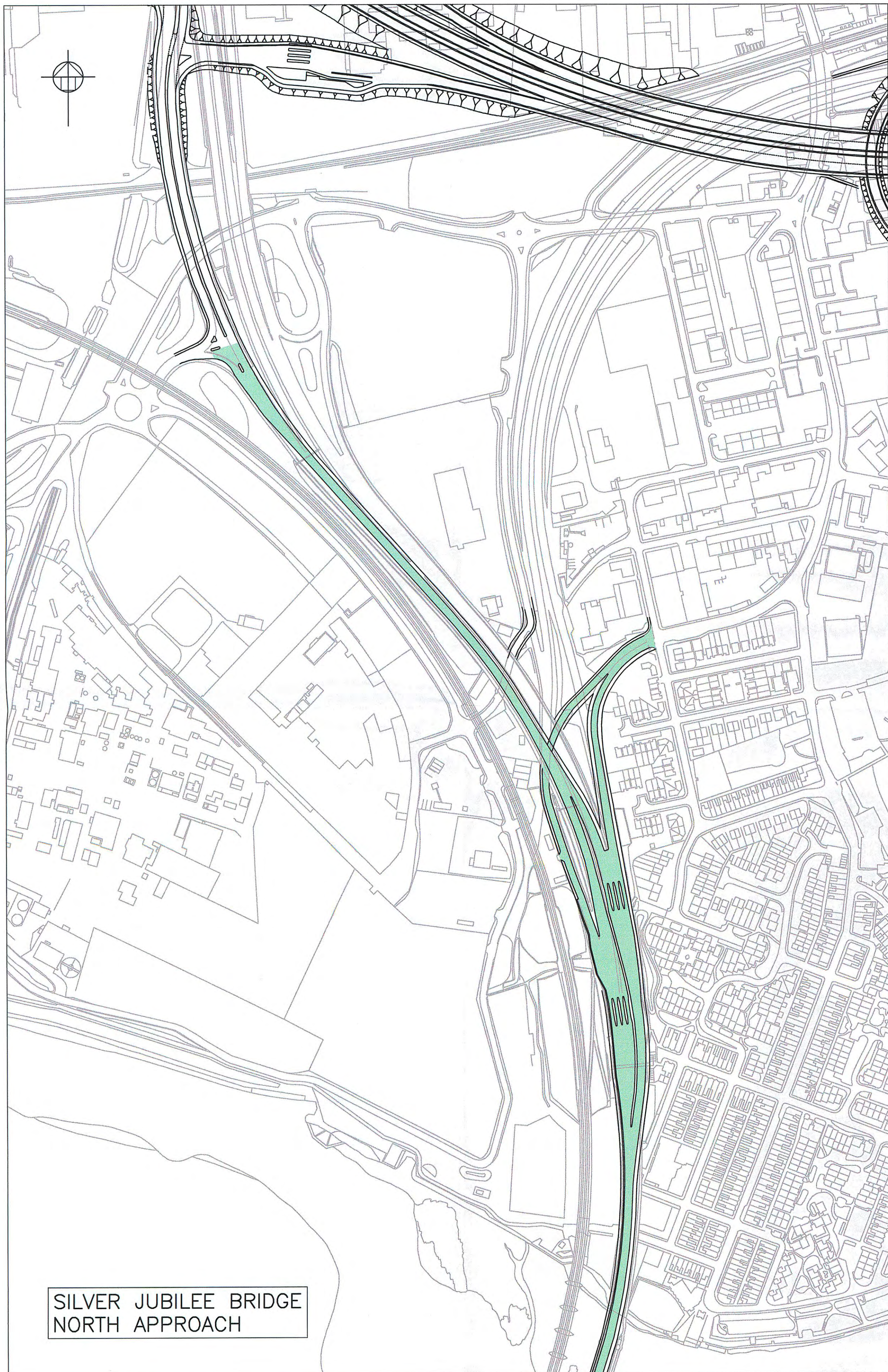
SILVER JUBILEE BRIDGE NORTH APPROACH